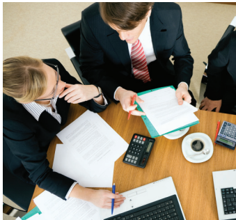
Achieve higher completion of on-time market release of your product