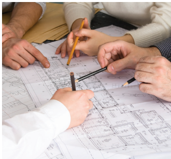
By involving NTS's Subject Matter Experts our clients realize significant cost savings

Managing ongoing day-to-day operations within your organization that are not a part of your company's core competency can create a drain on your talent resources. What's more, in today's marketplace you face ever-increasing pressure to: