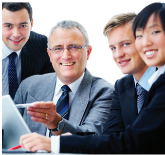
We provide a dedicated Program Manager as your single point of contact